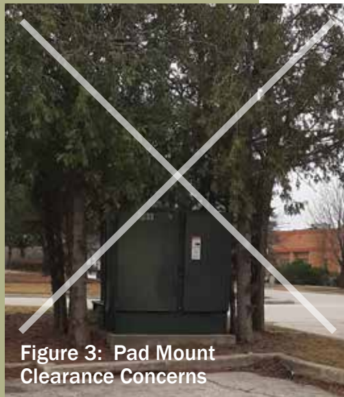
Figure 3: Pad Mount Clearance Concerns